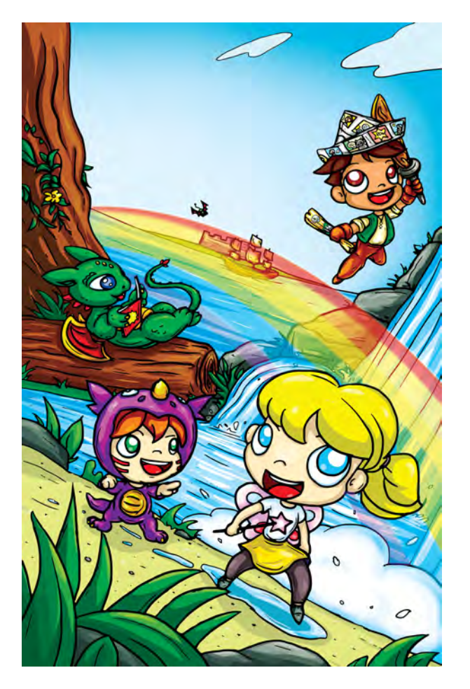
Illustration | Concept Art | Character/Prop Design | Storyboards & more

emilyatplay com emilydrouin@gmail com 603-540-5917