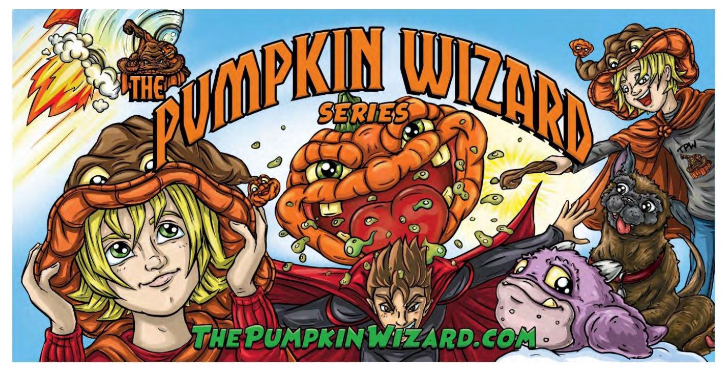
Illustration | Concept Art | Character/Prop Design | Storyboards & more

<u>The Pumpkin Wizard</u> is a children's book series focusing on anti-bullying and the power of imagination, kindness, friendship and treating each other with love and respect. There are currently 4 books in the series, with more installments to come! <u>thepumpkinwizard.com</u>